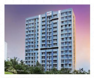
PLATINUM CASA DIVINE ANDHERI (W)