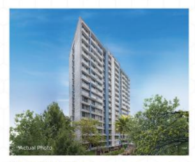
PLATINUM TOWER - 4 ANDHERI (W)